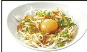
A snack on itama salad