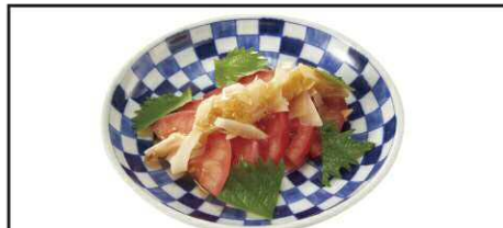
Tomato & pickled ginger ~with organic ginger sauce~