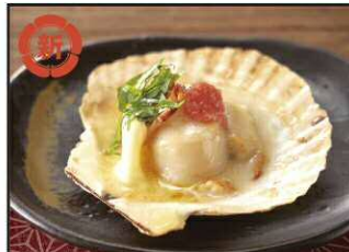
Grilled scallop with spicy pollack roe and butter