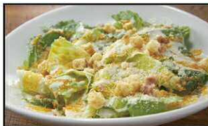
Caesar salad with Romaine lettuce