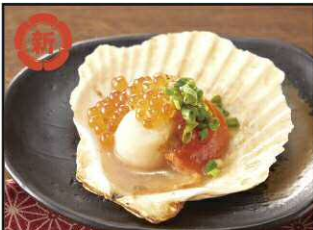
Grilled scallop with salmon roe