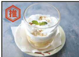
Soft snow thawing pudding 299 (税込 328)