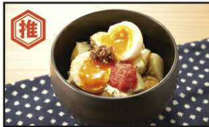
Korojaga taramosalata ~with organic jerusalem artichoke sauce~