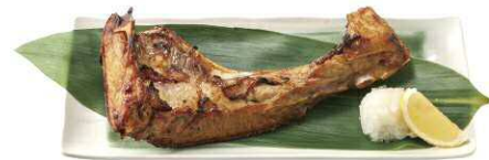
Grilled tuna meat cut from around the gills with salt