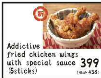
Addictive fried chicken wings with special sauce 399 (5sticks) (税込 438)