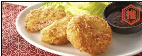
Crab cream croquette using raw milk from Hokkaido 599 (税込 658)