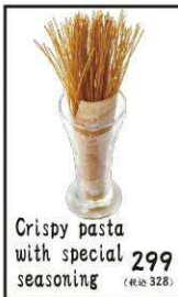
Crispy pasta with special seasoning 299 (税込 328)