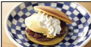
Pudding Japanese and Western Dorayaki 399 (税込 438)