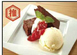
Chocolate brownie & vanilla ice cream with strawberry sauce 399 (税込 438)