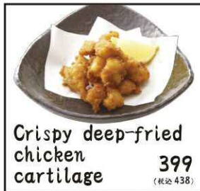
Crispy deep-fried chicken cartilage 399 (税込 438)