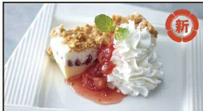
Crumbled cheesecake 399 (税込 438)