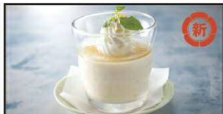
Fluce with white peach source 350 (税込 385)