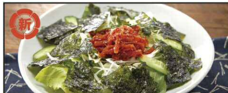
Korean-Style Choregi Salad with Korean seaweed and squid kimchi