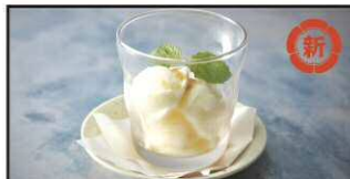
Frozen yogurt with lemonade sauce 299 (税込 328)