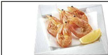
Full of Umami! Fried Shirahime-shrimp 499 (税込 548)