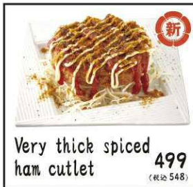
Very thick spiced ham cutlet 499 (税込 548)